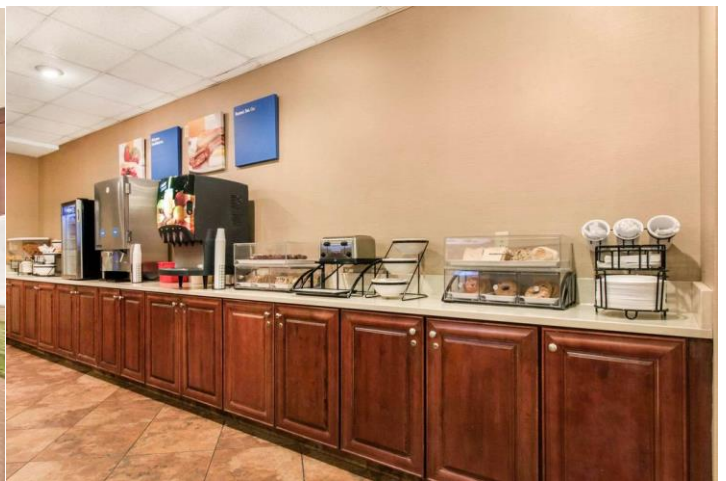
Dining Room- cold and hot cooked breakfast